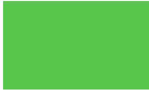
Mental Health Month Flag