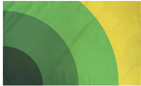
Mental Health Month Flag